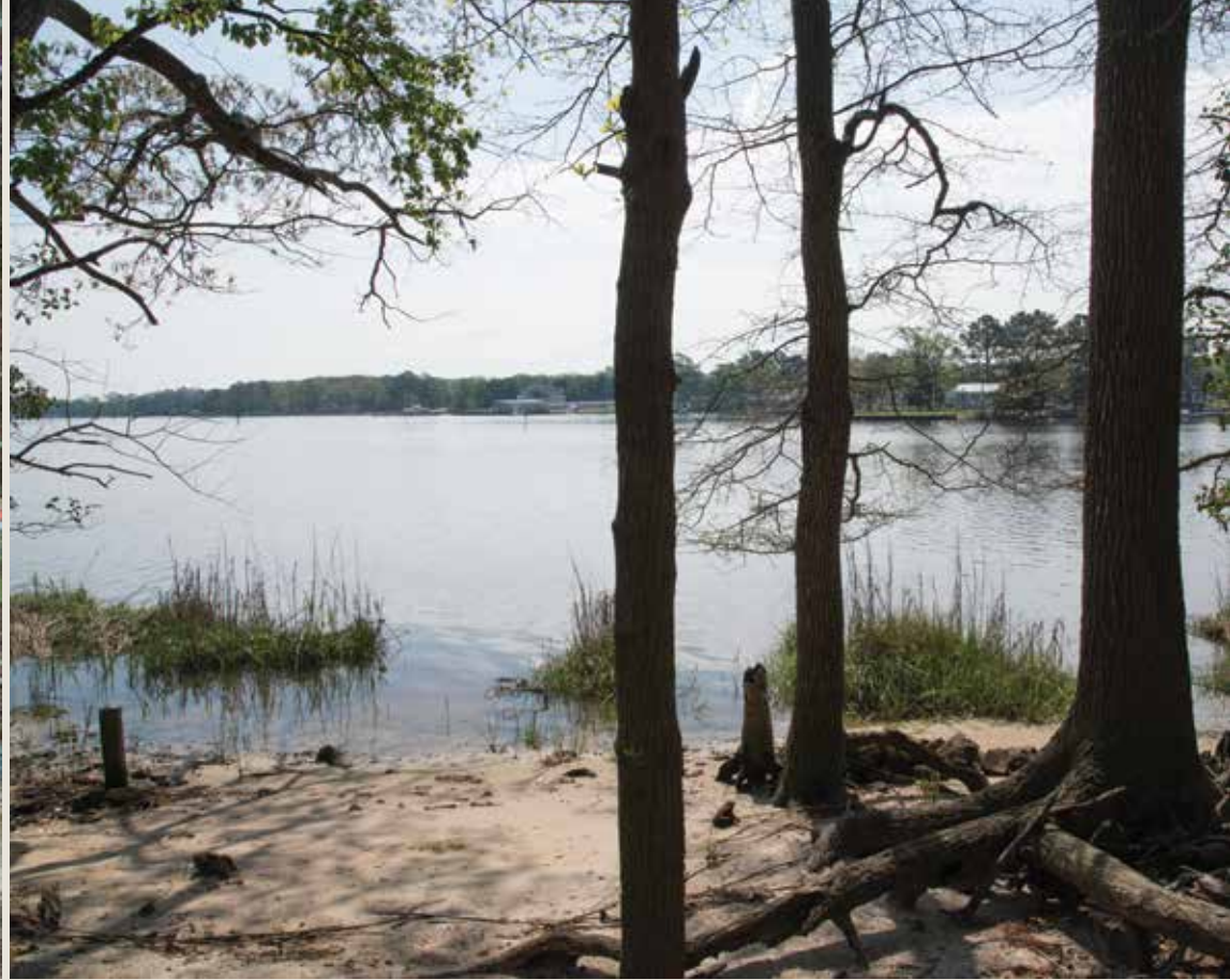
The blue waters of Pepper Creek come into view from many vantage points on the Woodland Trail.