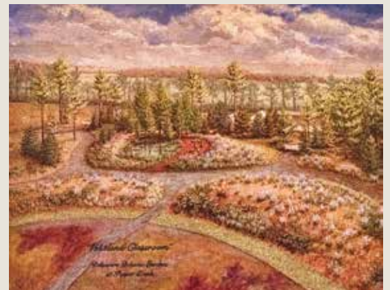
An artist's rendering of the Wetland Classroom and the Inland Dune Gardens,