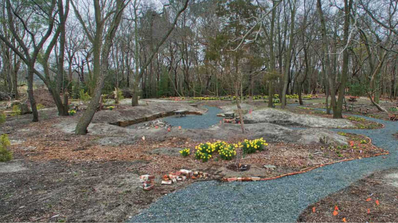
The Folly Garden is a place to pause between the Meadow and Woodland Gardens—the site of the old farmhouse, long gone.