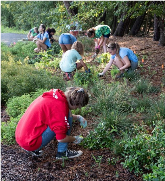
Girl Scout Troop 20566