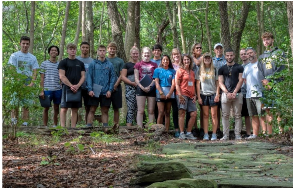
University of Delaware Landscape Design Students