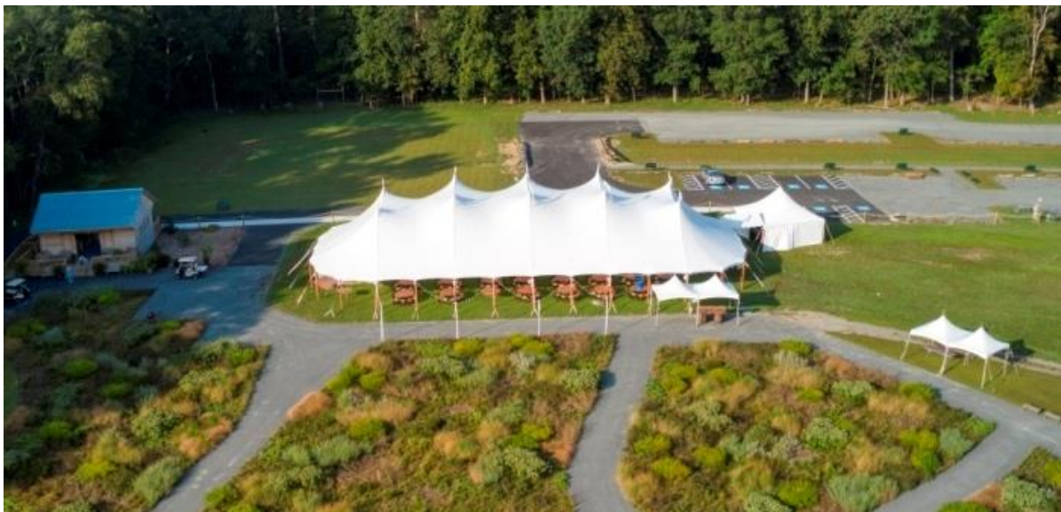
Coastal Tented Events sail tent kept everyone mostly dry during rainstorm