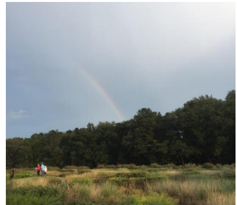
A faint rainbow followed the hard rain