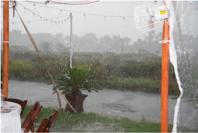
The rainstorm lasted 15 minutes