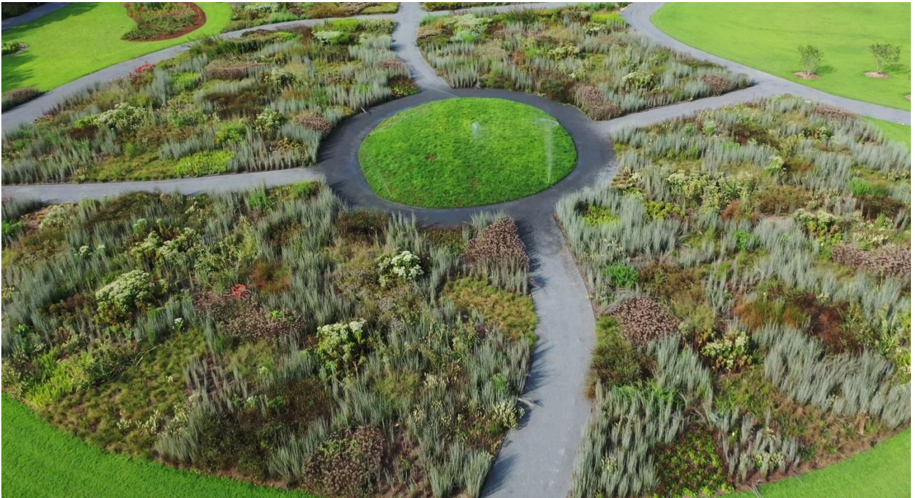
Upper section of Piet Oudolf Meadow Garden August 2019