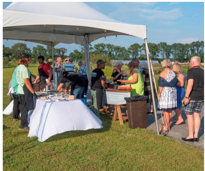
The Raw Bar Boat was a big hit!