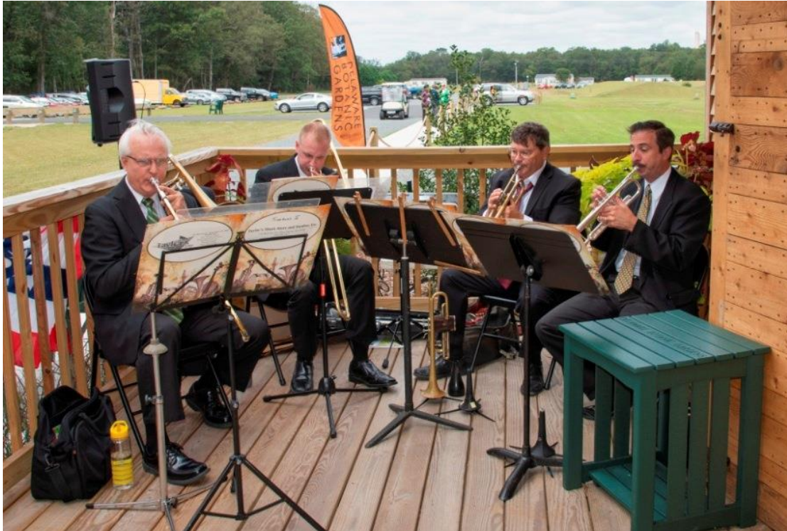
The Delaware Symphony Brass Quartet played at the Ribbon Cutting

DBG / Chamber of Commerce Ribbon Cutting, Thursday, September 19 at 1 pm – We hosted 100 guests at a DBG / Bethany Beach-Fenwick Area Chamber of Commerce ribbon cutting in front of the Welcome Center. The Welcome Center deck became our ceremony stage. Before and after the ceremony, we had music provided by the Delaware Symphony Orchestra's brass quartet. The sun was shining, the wind was blowing slightly, and you could hear the brass quartet all the way to the woodlands.