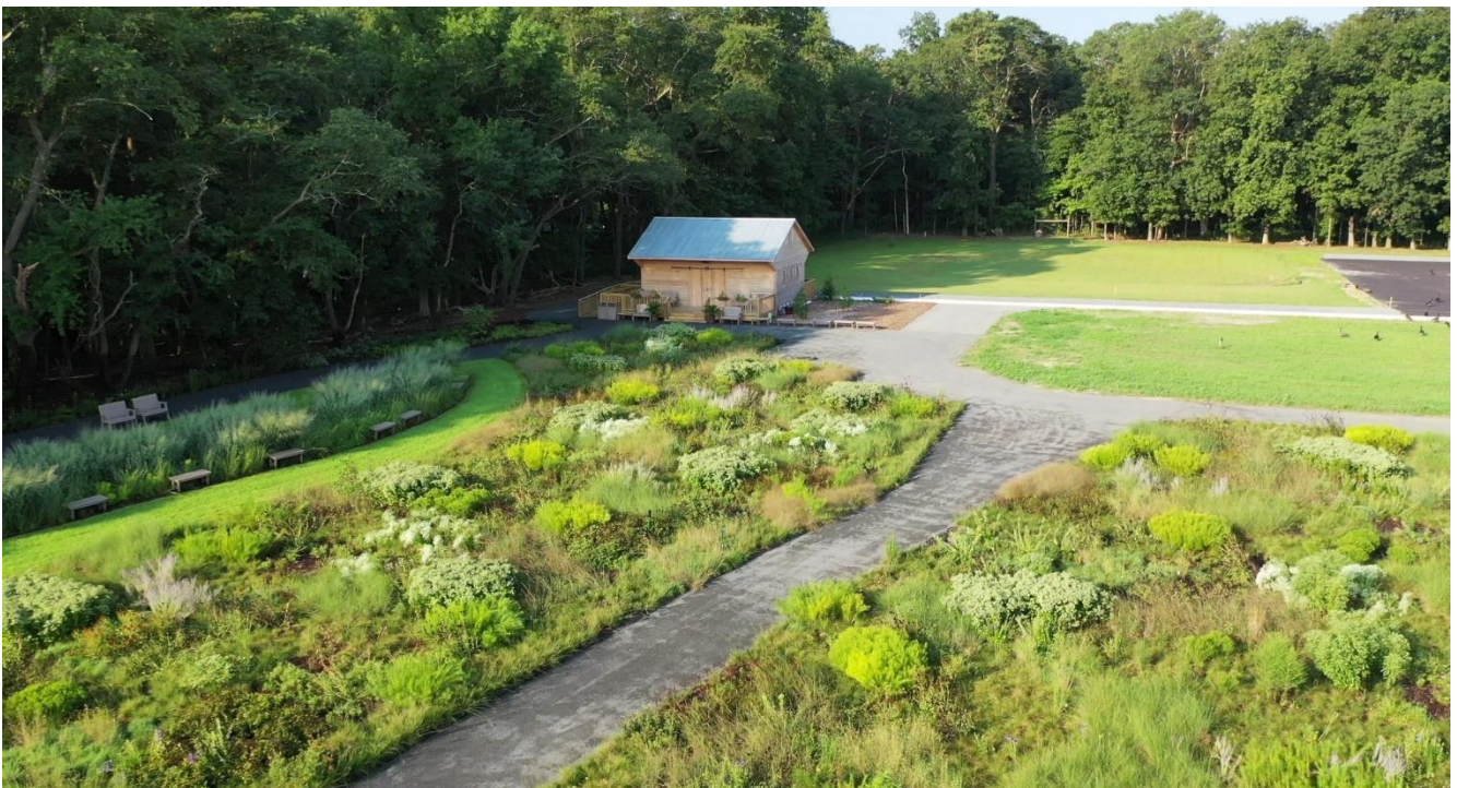
Lower section of Piet Oudolf Meadow Garden and Welcome Center August 2019