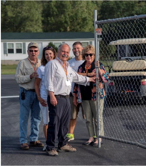
Opening the Garden Gates on Day 1

hospitality docents were all smiles as they checked-in our first guests! In short, the public grand opening week was a success thanks to our volunteers and staff.