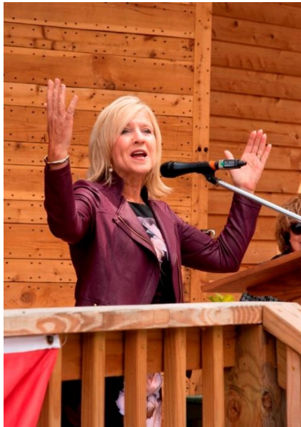
DE Lt. Governor Bethany Hall Long