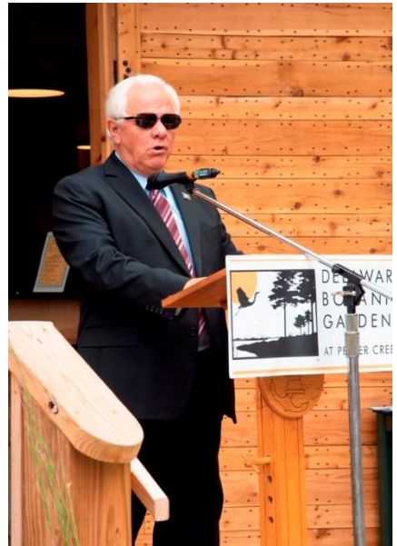
State Senator Gerald Hocker