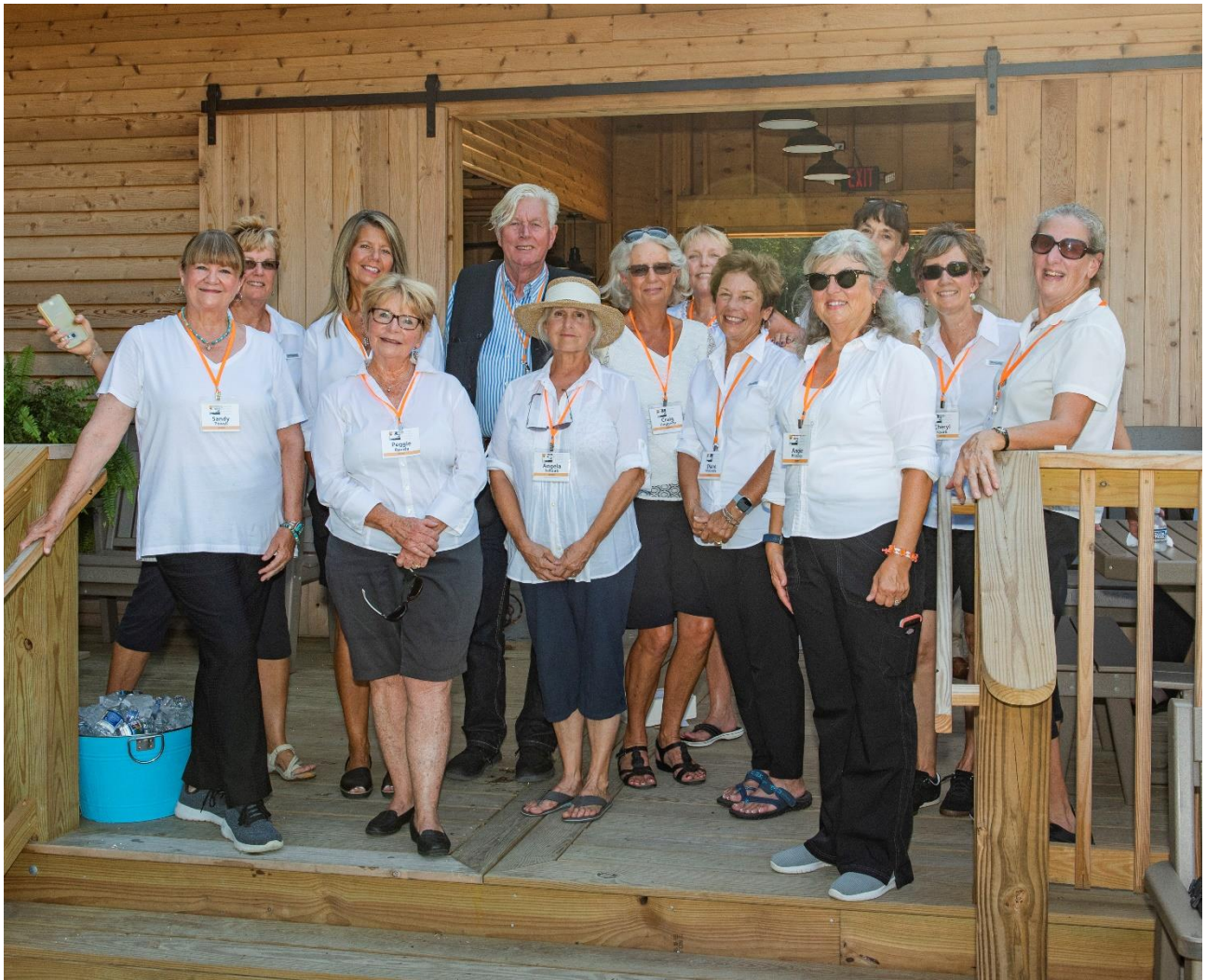
Docents at the Grand Opening Dinner with Piet Oudolf