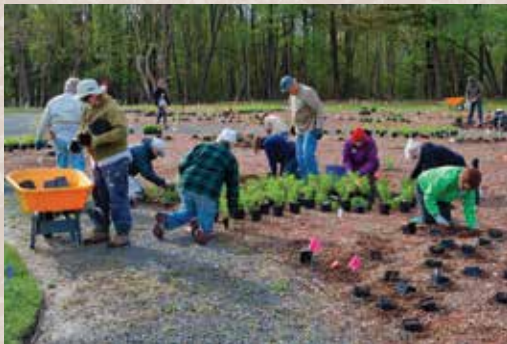
DBG volunteers plant 1824 blueberry bushes