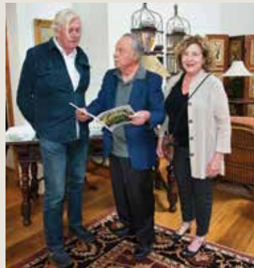
Piet Oudolf presentation at Inn at Montchanin

Whether it be planting over 70,000 meadow perennials and grasses; baring the roots of over 300 trees and shrubs; digging holes for over 25,000 Folly Garden bulbs; weeding, mulching, watering, debris maintenance (4,672 hours), the DBG volunteer Garden Stewards logged 7,685 total hours in 2018 with perseverance, drive, and commitment.