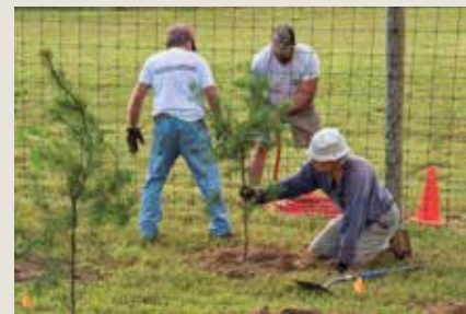
Planting Forest Service Street Trees

DBG implements both IVM and IPM approaches to control pests, invasives, and disease. This involves close monitoring of plants and trees as they arrive at the gardens and as they grow, using the least toxic method of controlling pests/disease (i.e. no non-natural pesticides or herbicides), and using disease-resistant native plants in planting designs that reduce the viability of unwanted species. The Piet Oudolf Meadow Garden is designed using a "matrix gardening" approach that uses native plants situated in patterns to provide resistance to destructive pests and diseases. This garden is self-sustaining in that 1) the native and pollinator-compatible plants themselves attract desired birds, bees, butterflies, and other natural pest predators; and 2) they are situated in a design that supports neighboring plant nourishment and protection. 3