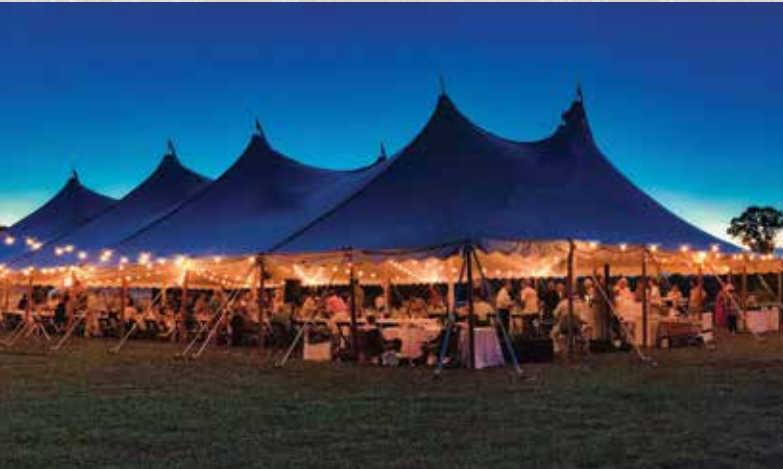
Tent at 2018 Dinner Party fundraiser