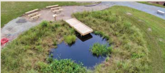
Restored wetlands in the Dogfish Head Learning Garden