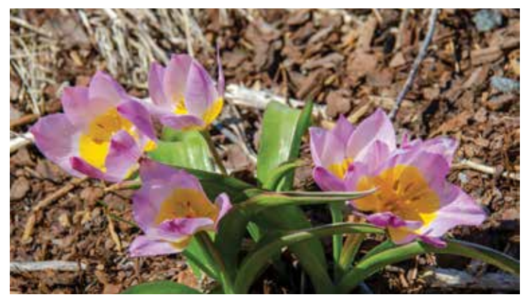
DELAWARE BOTANIC GARDENS Spring 2023

We had a sunny blue sky, but it was very cold—from 34 degrees at 9 a.m. to 58 degrees at 4 p.m. Everybody was happy to be back in the gardens, with the new 200,000 spring bulb show—thanks to the staff and volunteers planting 86,000 new bulbs last fall added to those already planted last year.