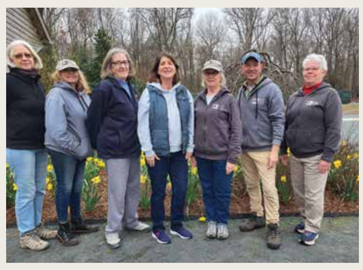
Education Committee.

A great start to the 2023 season has increased demand for classes, tours, and garden programs which have all been well received. The education team has met several times to manage program updates. DBG has already enjoyed several sold-out classes, including the following: