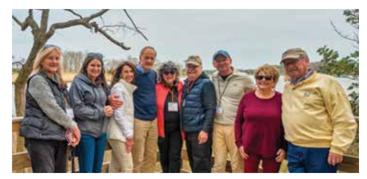
March 31 visit of Senator Tom Carper