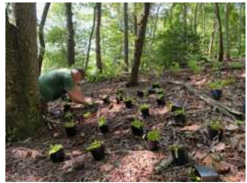
Garden Steward planting fern on the Knoll

In collaboration with the Delaware Center for the Inland Bays (CIB), we have finished the first phase of our Living Shoreline Project, which will protect and help sustain approximately 300 feet of DBG's shoreline. Our team and volunteers have been working with CIB staff and volunteers to install an anchored-branch toe (ABT) as the first phase of the project. The ABT is constructed of natural materials found from DBG's Woodland Gardens and will help reduce the energy coming ashore from boat wake and waves. We are excited for the completion of this project in the fall with additional phases including planting of native salt grasses and construction of a viewing platform.