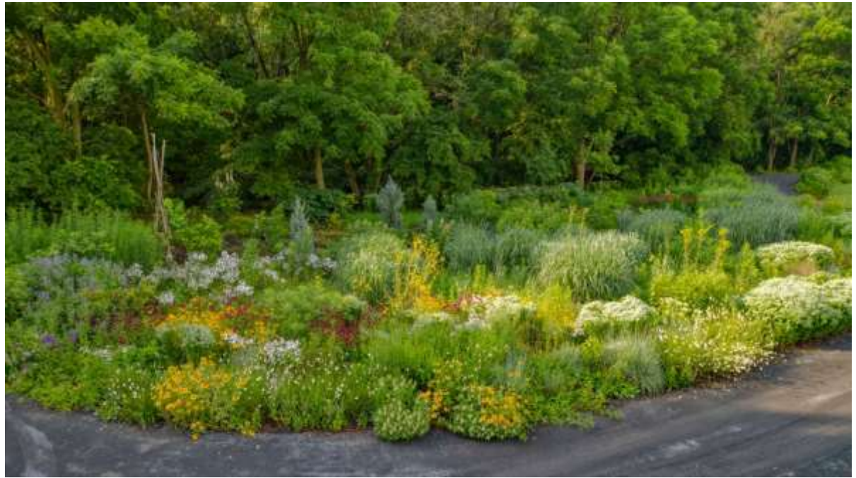
East Woodland Edge Garden