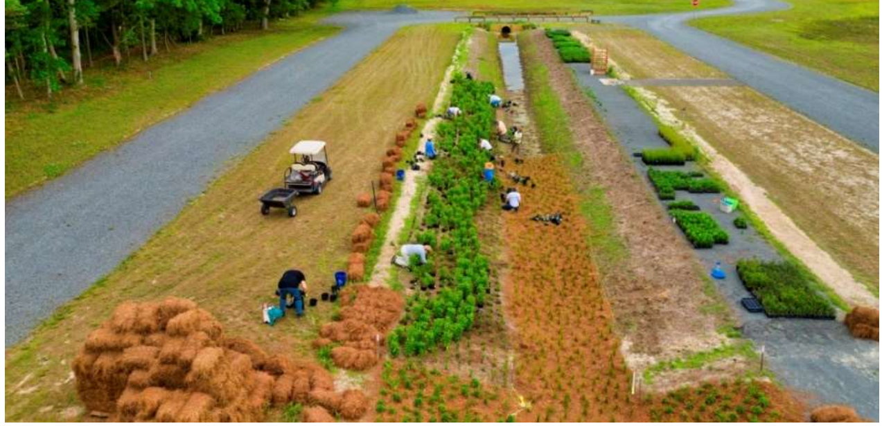
Garden Stewards at work on the Rhyne

provide seasonal colors. These native perennials help slow and filter water flowing from our parking area into the natural environment.